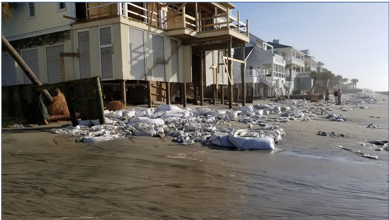
Photos from Isle of Palms following Hurricane Irma . These photos show the beach condition near the Wild Dunes Grand Pavilion (upper) and along Beachwood East (lower).