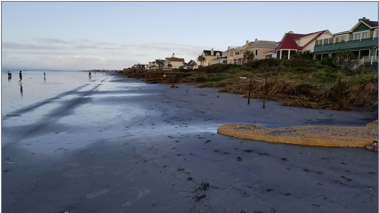
Photos from Isle of Palms following Hurricane Irma . These photos show the general beach condition along the southern end of the island.